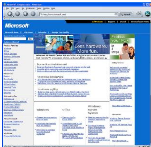
Figure 1.2: Microsoft's site viewed in Netscape 7.1

For example, on the IE-generated page, pictures appear to the left of the links on the center of the page. Also, the links at the bottom center of Figure 1.1 have illustrated headings with Microsoft's signature logo. However, the pictures in Figure 1.2 are removed on the non-IE generated page and the illustrated headings are replaced by simple text, such as "Windows" or "Office." It's not that this version of Netscape cannot handle the type of things Microsoft is attempting to use (i.e. menus, image headings), it's that Microsoft's developers are taking a "one-size-fits-all" approach to visitors using Netscape's browser.