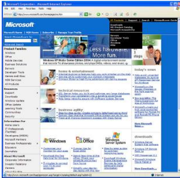
Figure 1.1: Microsoft's Site viewed in IE6

Let us look at Microsoft homepage, located at http://www.microsoft.com . This site is set