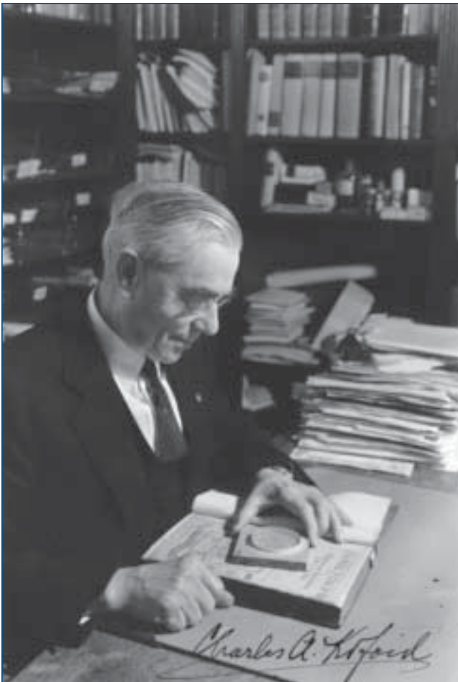
Figure 1. Charles A. Kofoid is the first microbiologist to work at Scripps.