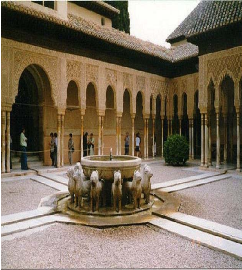
Palace of the Lions

Few buildings from the Middle Ages have increasingly captured the imagination of visitors throughout time like the Alhambra. According to Lonely Planet, 6,000 tourists visit the Alhambra in Granada, Spain, per day 1 to immerse themselves in the lush gardens and stunning decoration of the Alhambra palaces.