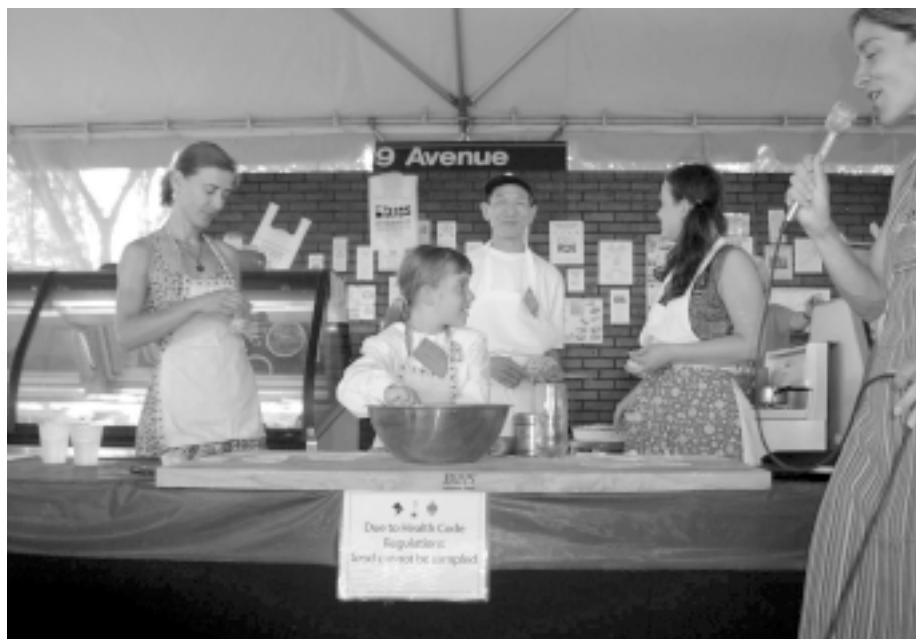
Cooks from Brooklyn, Queens, and Manhattan (by way of Shanghai) share their dumpling-making styles and lore at the Folklife Festival.

Dr. Nancy Groce, a folklorist and the overall curator for the New York City program, in turn hired curators for subjects such as Wall Street, Broadway, transportation, music, fashion, and foodways. Smack dab between the Capitol and the Washington Monument sat a No. 7 subway car, an air-conditioned city bus, a Rosenwath water tower for visitors to walk